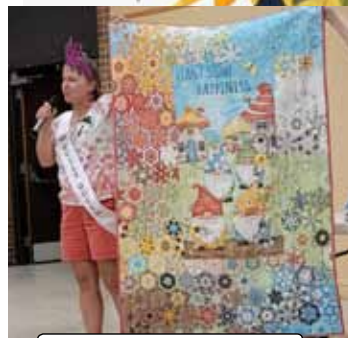
Gwen H. One-Block-Wonder Quilt