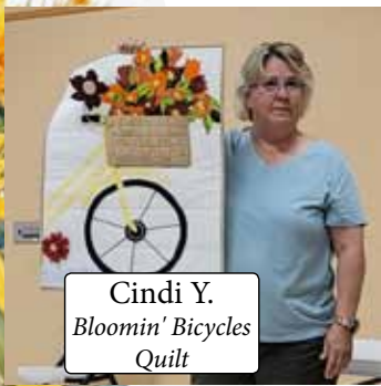
Cindi Y. Bloomin' Bicycles Quilt