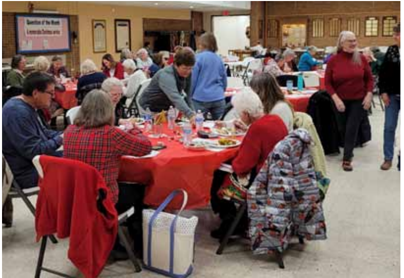
Lovely Christmas Meal