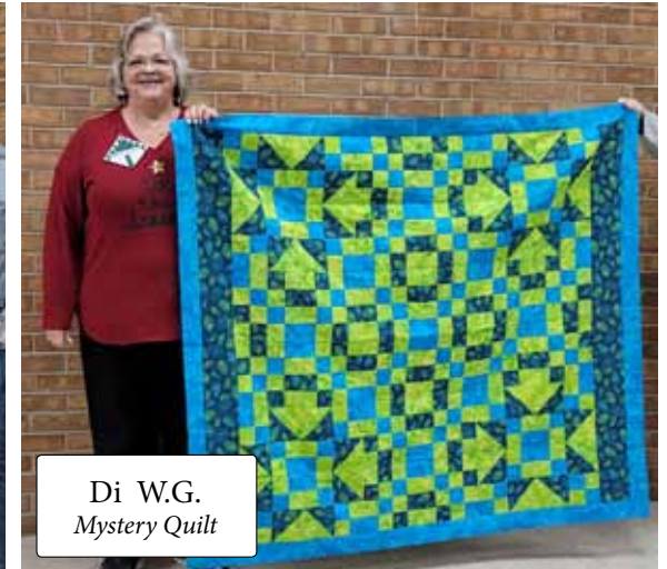
Di W.G. Mystery Quilt