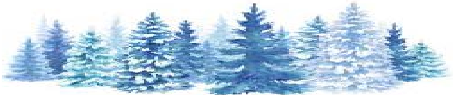
Beat The Winter Blues Retreat at LCCC - Cindi Young