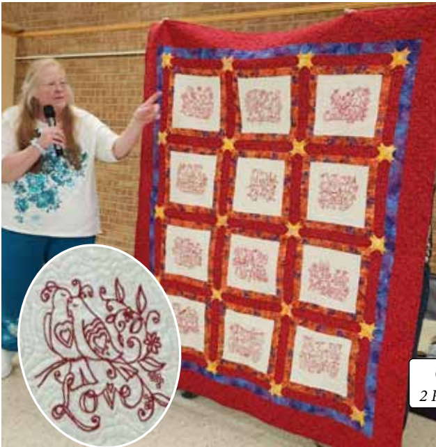
Gale D. 2 Round Tuits