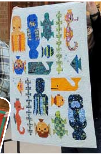
Cindi Y. Sea Themed Baby Quilts