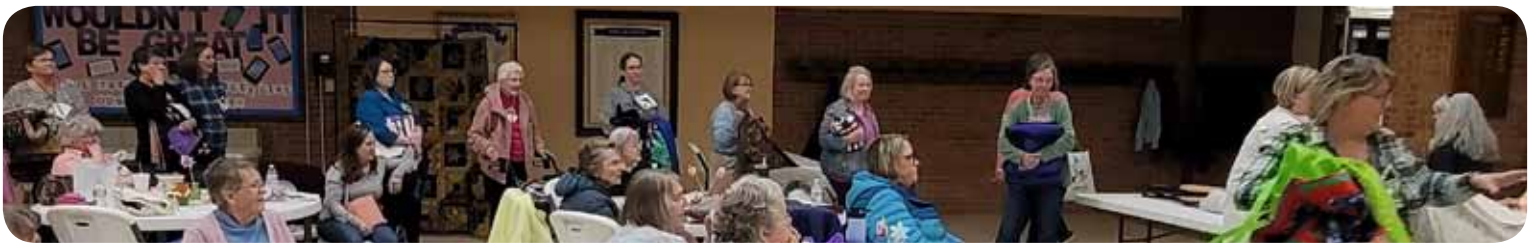
Just look at this marvelous turnout of Show and Tell. Wow!