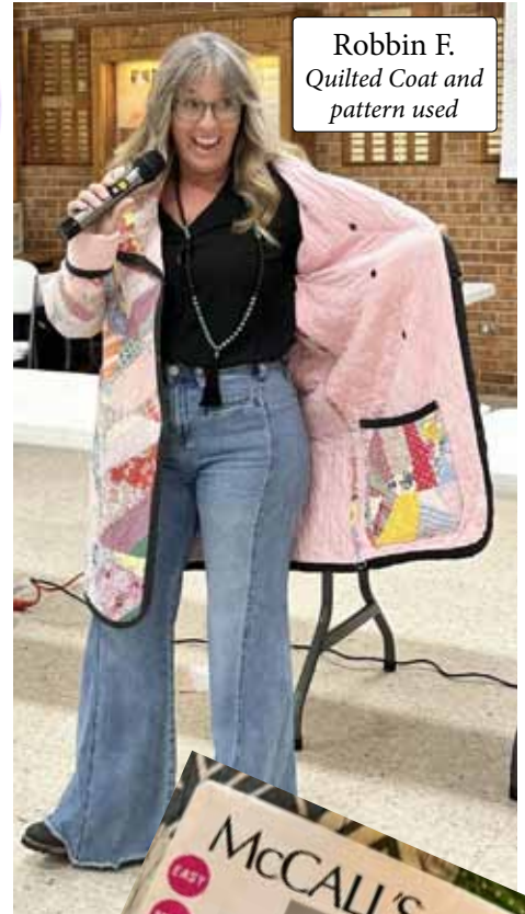
Robbin F. Quilted Coat and pattern used