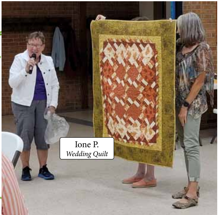
Ione P. Wedding Quilt