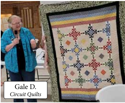
Gale D. Circuit Quilts