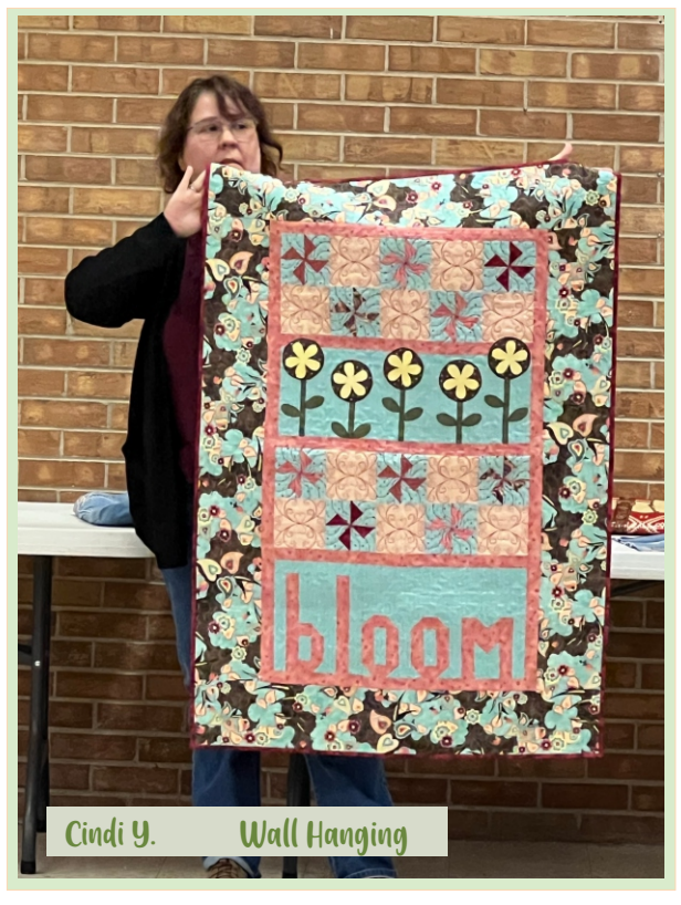
Register your Show and Tell quilt at the welcome Desk before the meeting Starts