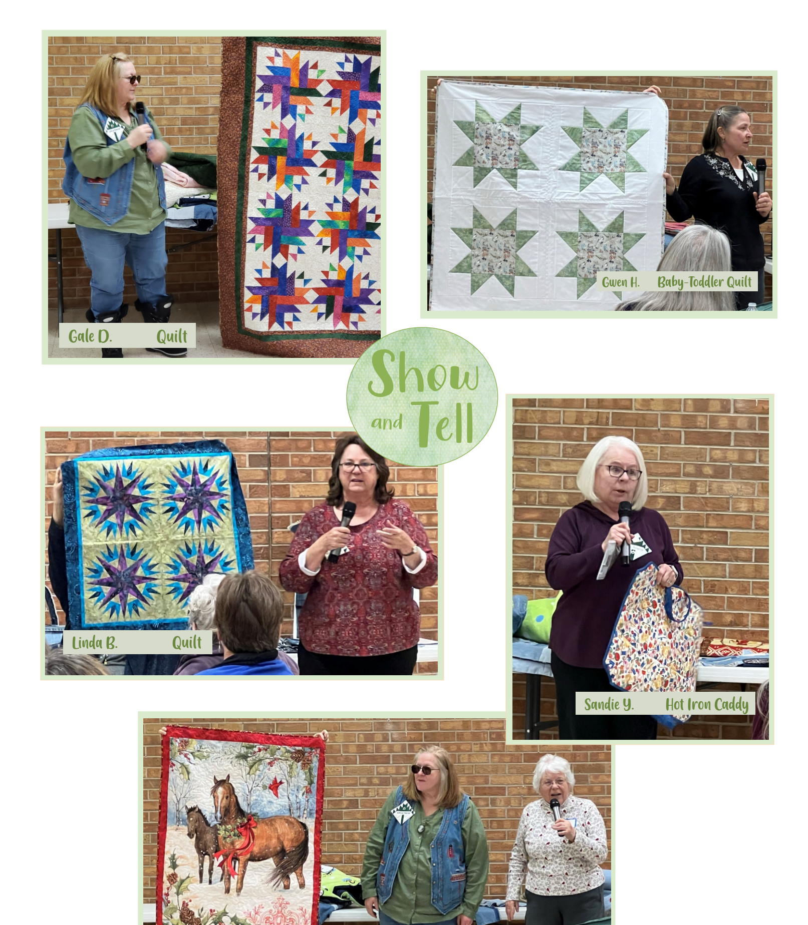
Register your Show and Tell quilt at the welcome Desk before the meeting Starts