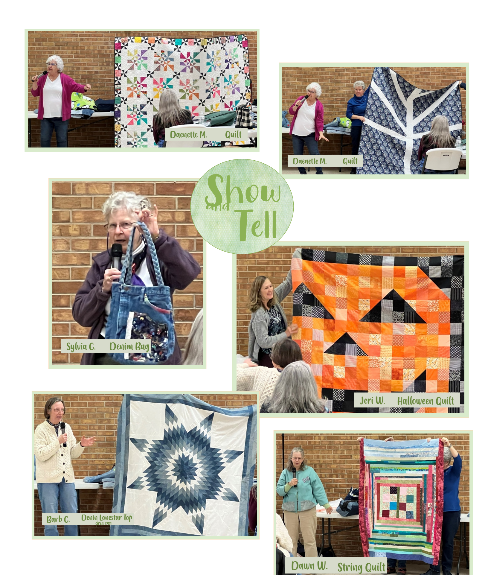
Register your Show and Tell quilt at the welcome Desk before the meeting Starts