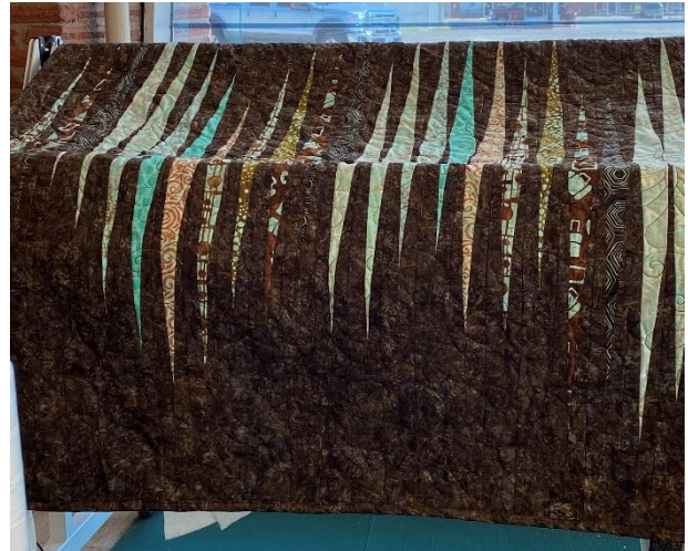
3 Quilts from Cynthia