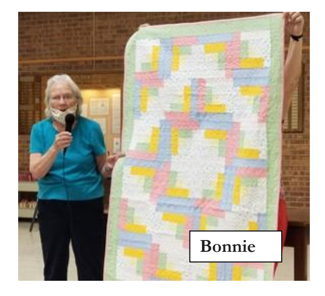
July 20<sup>th</sup> Show & Tell