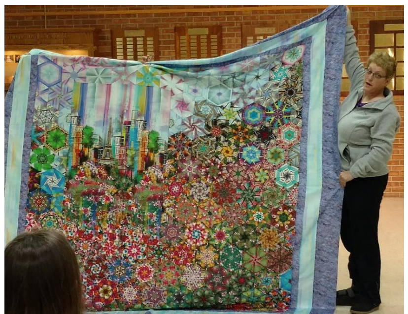
Denim & Diamonds Auction Quilt