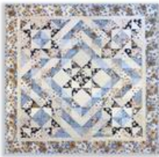
Five Star Quilt!