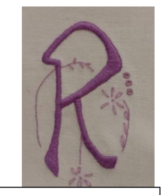
One thread satin stitch